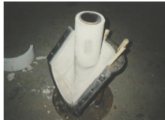
EUCOR Lined Burner Elbow