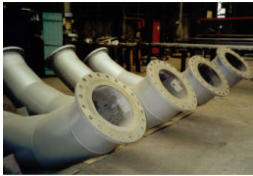
EUCOR Lined PF Elbows