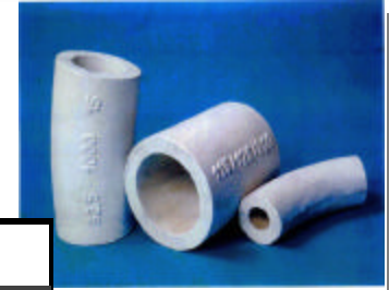
Monolithic Pipe Liners